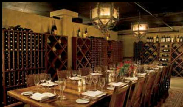
■ POOL AND POOL HOUSE ■ TROPHY ROOM