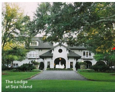
The Lodge at Sea Island