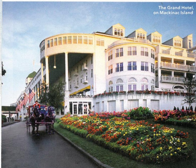
The Grand Hotel, on Mackinac Island