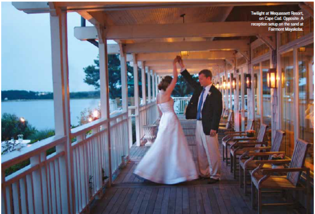
Twilight at Wequassett Resort, on Cape Cod. Opposite: A reception setup on the sand at Fairmont Mayakoba.