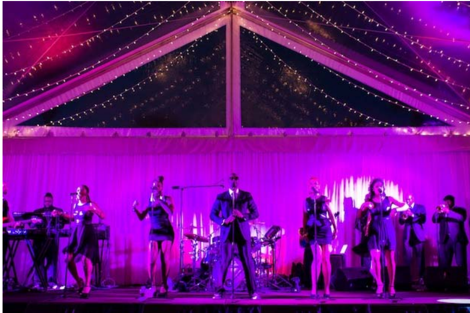
Beauty Kimberly's Back Porch (hair), Kimtasha Pro Makeup Artist (makeup) Bridal Gown Vera Wang Bridal Salon Saks Fifth Avenue Bridesmaid Gowns Amsale Cake/Catering Sea Island