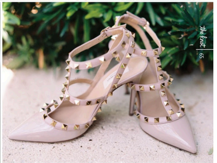
The Knot 65