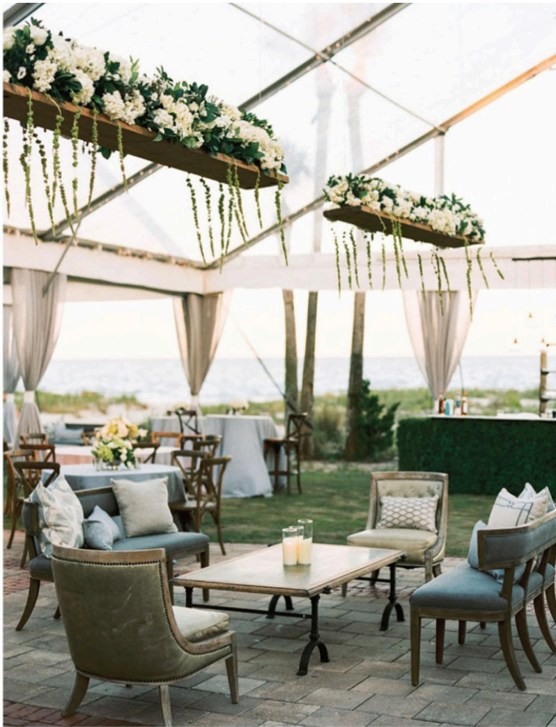
Muted accent colors, French 75s passed in coupes and a live painter appearance created a European atmosphere. The duo added details closer to home too by including iced cookies shaped like Texas (the bride's home state) and Alabama (the groom's) in welcome bags along with other personal treats.