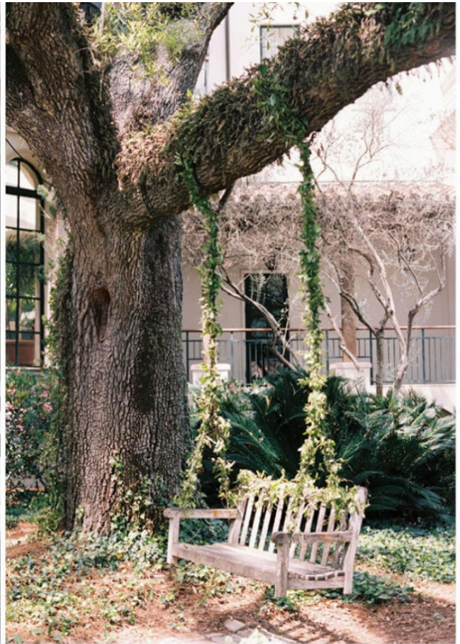
On the way to the ceremony, guests passed large oak trees and a swing covered in greenery. The newlyweds made their tent entrance to Whitney Houston's "I Wanna Dance with Somebody" played by a 14-piece Motown band and kept dancing all night, only breaking for late-night snacks of mini chocolate milkshakes and popcorn.