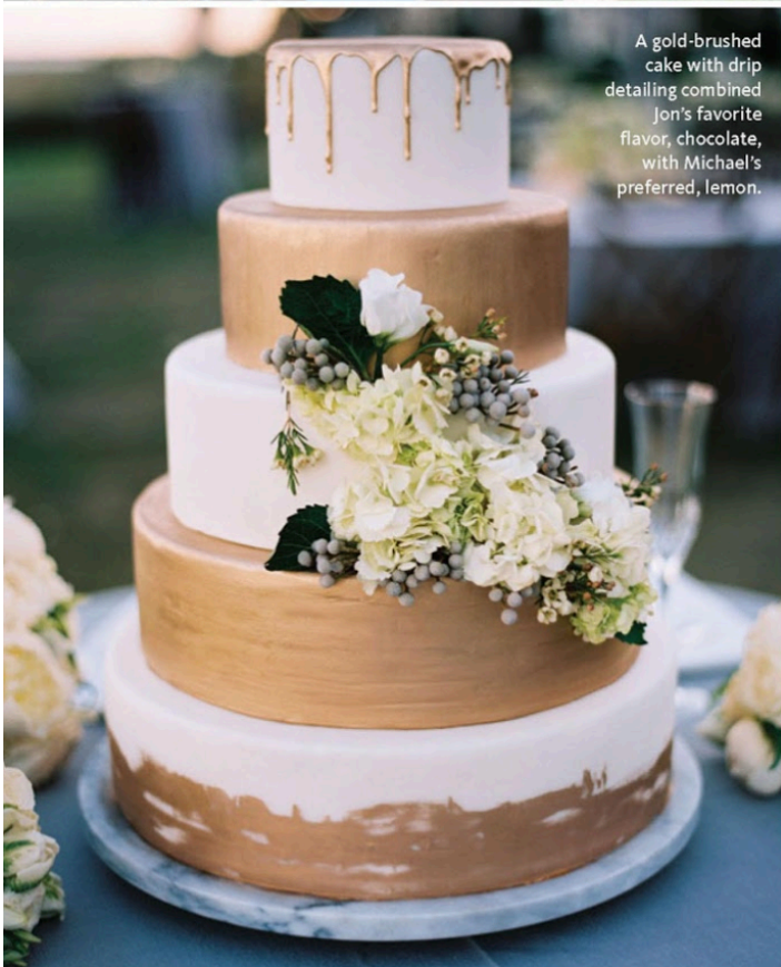
A gold-brushed cake with drip detailing combined Jon's favorite flavor, chocolate, with Michael's preferred, lemon.