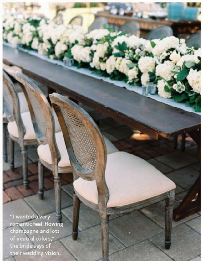
"I wanted a very romantic feel, flowing champagne and lots of neutral colors," the bride says of their wedding vision.