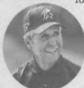
Gary Player

It takes more than well-placed bunkers or long fairways to make a memorable golf course, says Gary Player , a championship golfer and course designer. The South African urges travelers to look for beauty and serenity. "People