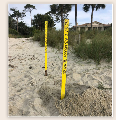
Sea turtle nest marker on Sea Island beach.

The Sea Island Adopt-A-Nest program allows donors to be assigned a specific nest – either virtually or with their family name displayed beachside on a nest marker - and receive regular updates on the status of their nest and hatchlings. All donations raised as part of the program, which topped $58,000 in the 2022 season, go directly to the Wildlife Conservation Fund within the Georgia Department of Natural Resources. These funds are crucial for providing survey supplies, ATVs, predator screens, and nesting stakes for research centers throughout Georgia's coast and barrier islands.