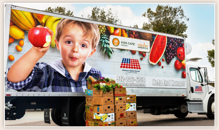
America's Second Harvest donation truck.

I first started working with Second Harvest when the Sea Island leadership team, who is passionate about helping make meaningful change in our community, was reviewing opportunities for giving back. We began working with Second Harvest on a community challenge where Sea Island would match any funds raised which resulted in a $500,000 grant from Sea Island to Second Harvest.